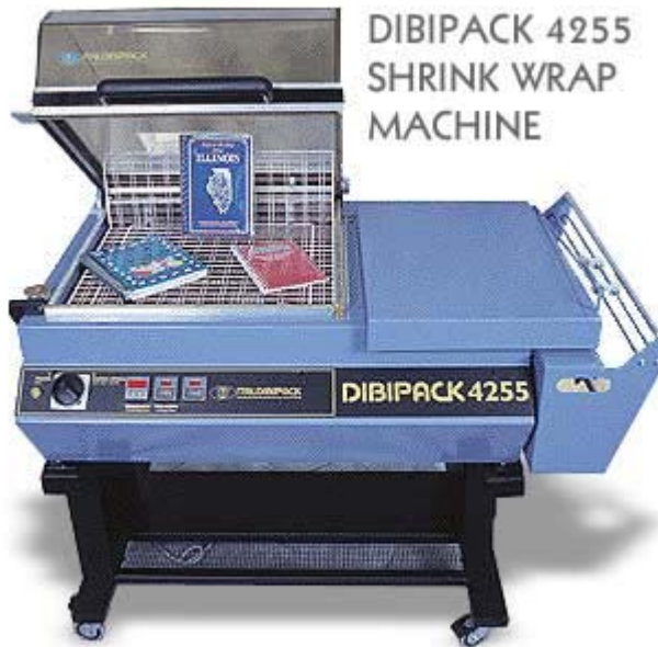
DIBIPACK 4255 SHRINK WRAP MACHINE

This one step shrink and seal system offers a 6-8 package per minute speed, and a packaging size up to 16.5" x 21.5" and up to 12" tall. It also has a magnetic hood hold-down that increases packaging speed and efficiency.